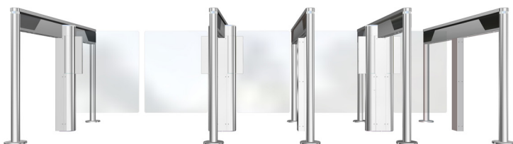
SL 950 EW + SL 944 + SL 945 Twin

The SlimLane 950 Extra Wide is a modular product that can be installed as a single or a multi-lane array and can also be combined with the SlimLane standard lane model. It can also be completed with a service lane.