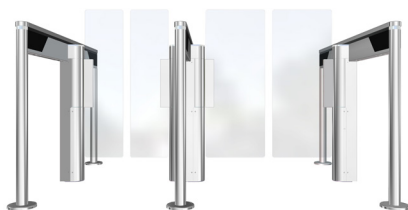
SL 940 + SL 950

The SlimLane 940 is a modular product that can be installed as a single or a multi-lane array and can also be combined with the SlimLane 950 standard lane model. It can also be completed with a service lane.