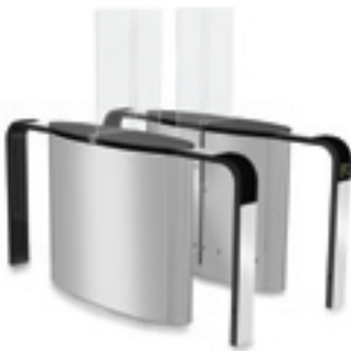
SmartLane 902 with Enhanced Entrance/Exit Control Footprint*: 2000 x 1200 mm (78 3/4 " x 47")