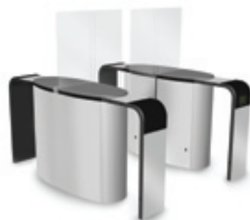
SmartLane 912 with Enhanced Entrance/Exit Control Footprint*: 2000 x 1800 mm (78 3/4 " x 70 7/8 ")