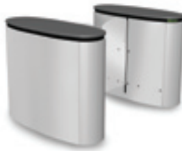
SmartLane 910 Footprint*: 1200 x 1800 mm (47" x 70 7/8 ")