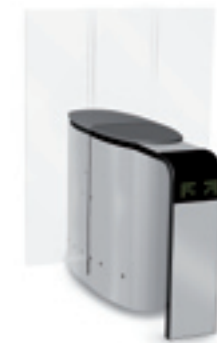
SmartLane 911 Twin with Enhanced Entrance Control and Compact Footprint Footprint*: 1600 x 1450 mm (63" x 57")