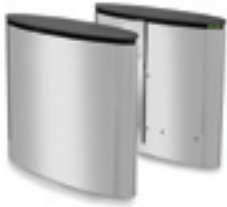
SmartLane 900 with Compact Footprint Footprint*: 1200 x 1200 mm (47" x 47")