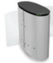
SmartLane 910 Twin with Compact Footprint Footprint*: 1200 x 1450 mm (47" x 57")