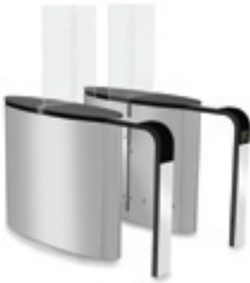
SmartLane 901 with Enhanced Entrance Control Footprint*: 1600 x 1200 mm (63" x 47")