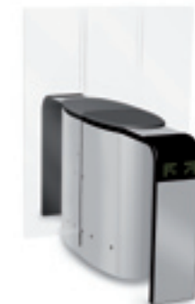
SmartLane 912 Twin with Enhanced Entrance/Exit Control and Compact Footprint Footprint*: 2000 x 1450 mm (78 3/4 " x 57")