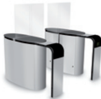
SmartLane 911 with Enhanced Entrance Control Footprint*: 1600 x 1800 mm (63" x 70 7/8 ")